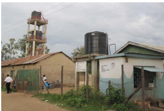
The pumping station annex water kiosk and the water tower

The implementation started in 2001, with SANA International as the implementing agency. The Ministry of Water and Irrigation, together with SANA, provided technical advice. The project was completed in 2006 and by then it constituted a borehole with a depth of 110 metres, a pumping station, a tower with two storage tanks of 10,000 litres each, a small office at the bottom of the tower, a pipeline system of about 5 km, seven water kiosks, and 60 private connections to homes.