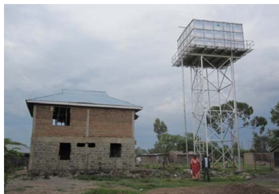
The new water tank and the new office / sanitation block / conference room under construction

In addition, there are various plans for the (near) future: