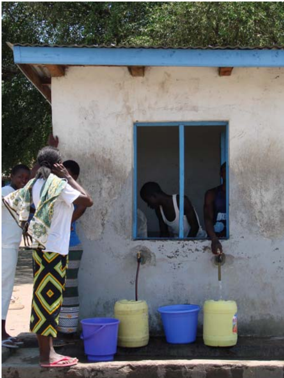
One of the water kiosks operated by the Company

In May 2011, connection costs as well as consumption costs for both individuals and institutions had to be raised. This was “inevitable” because of the increasing operational costs, such as wages, maintenance costs and especially costs for electricity. This meant for instance that the price of water for individual consumers from a water kiosk increased from the original one shilling per jerry can of 20 litres to two shillings. Yet, compared with ‘normal’ prices, this is still relatively low.