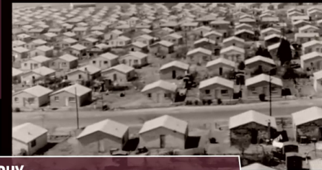
ATROPHY , Short film by Palesa Shongwe - Big Fish School & Little Pound Production.